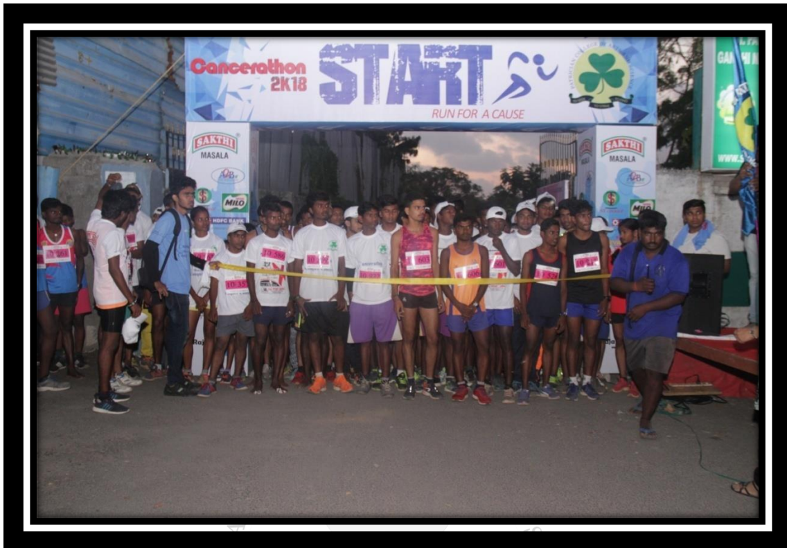
25.02.2018 - Cancerthon starting point