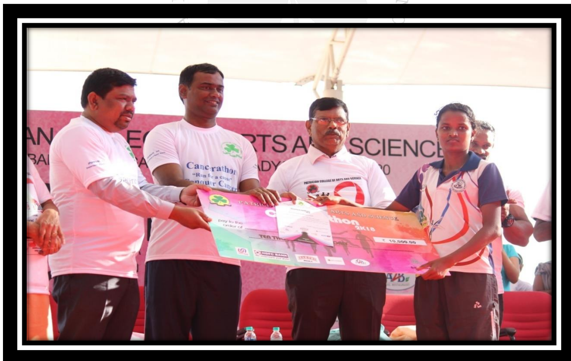
25.02.2018 - Certificate distribution to the Marathon winners