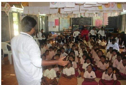
Performing puppetry in the School