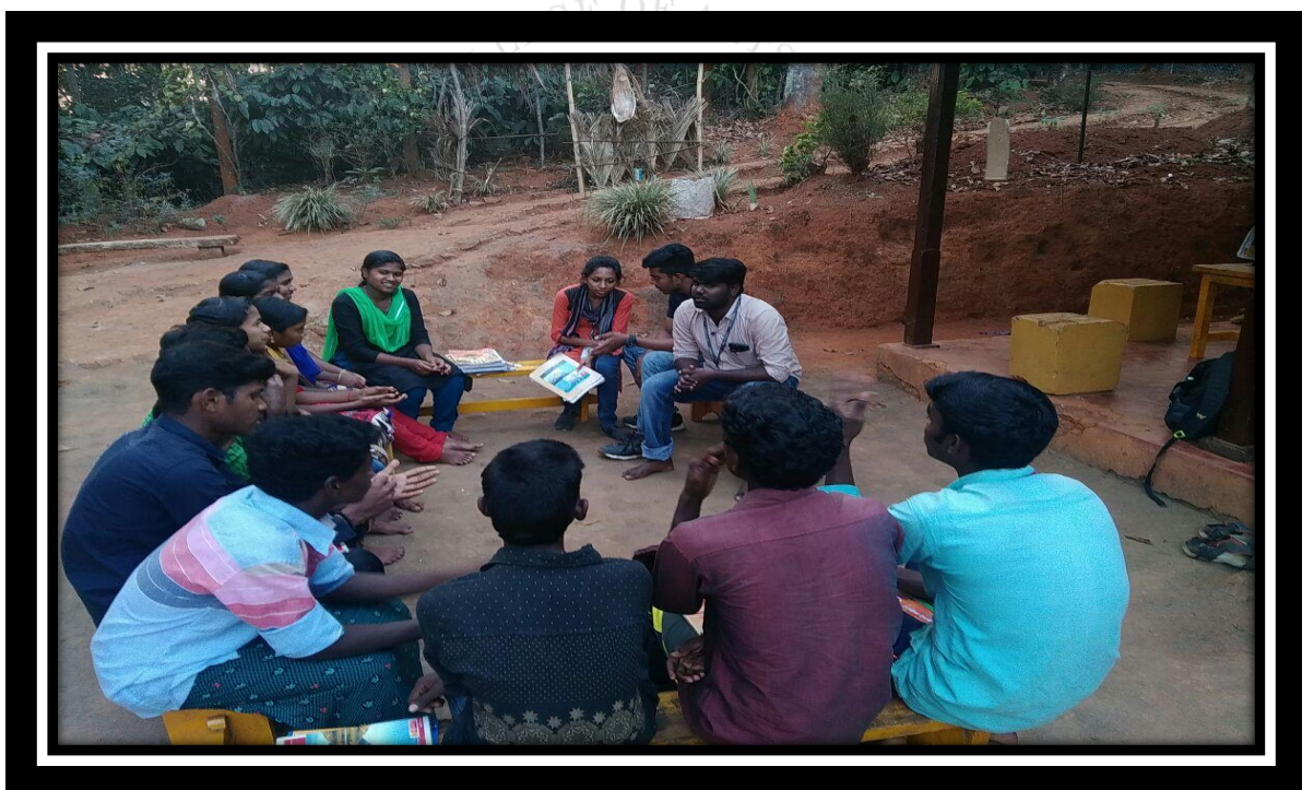
Our Students teaching the tribal children at Ambalamola, Niligiri District in March 2018