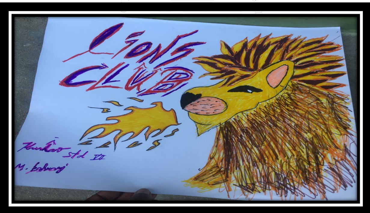
16.11.2017 – Drawing of a Child in the drawing competition.