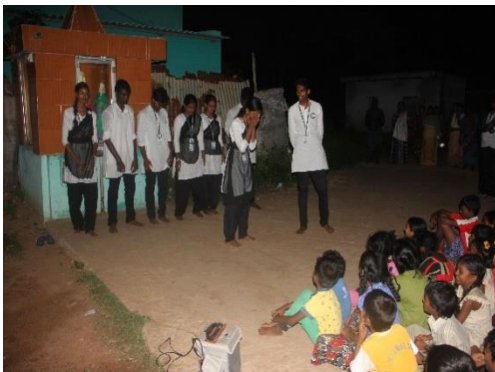
Street Theatre on Alcoholism

Sethilpakkam, the trainee and the co-trainees went to conduct community organization in Roshanagaram and did street theatre on Alcoholism.