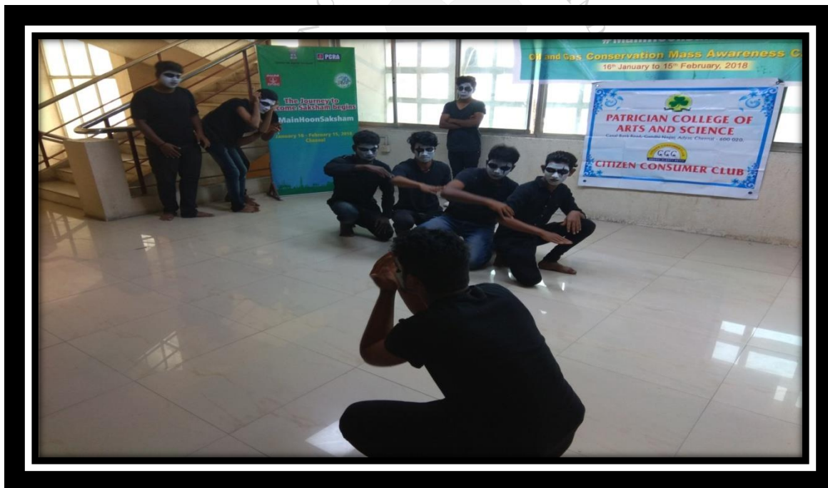
12.02.2018 – Mime by the volunteers of Citizen Consumer Club on Energy Conservation