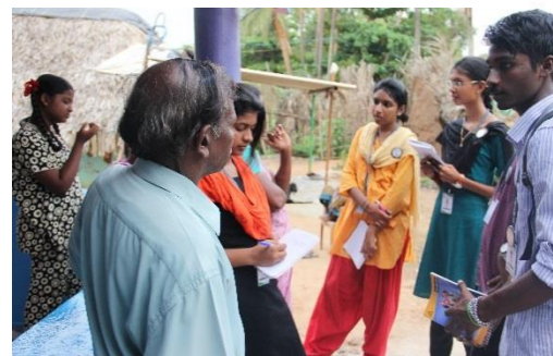
Conducting Socio - Economic Survey