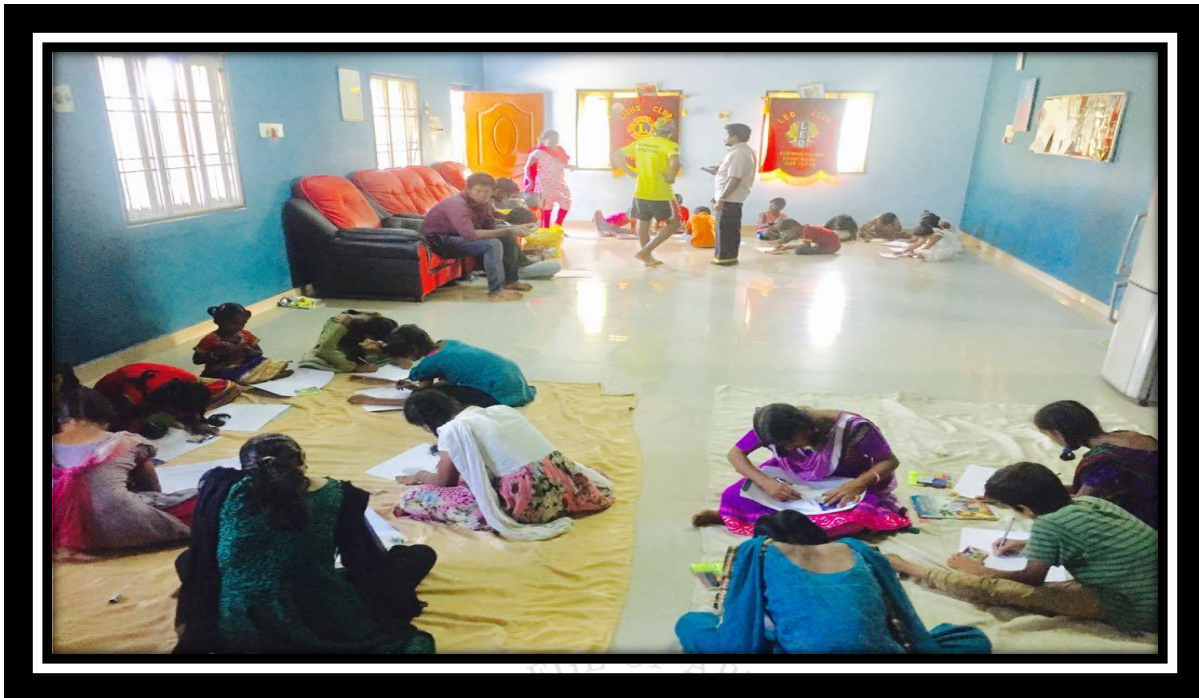
16.11.2017 – Drawing competition at Kaakkum Karangal Children's Home