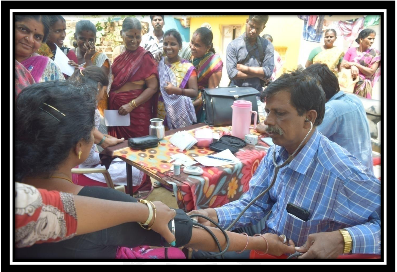
22.2.2018 - Health Check up for the village people of Thiruniravur, by Doctors of Saviour Medical Trust