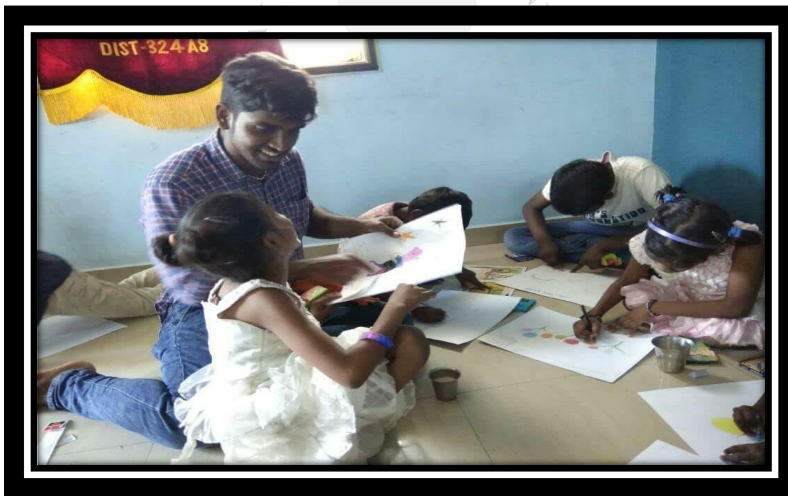
16.11.2017 – Leo Club Students conducting Drawing competition at Children’s Home