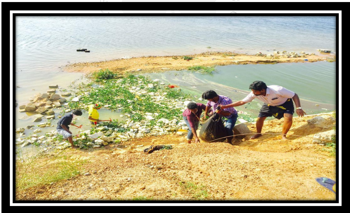
18.11.2017 – Cleaning of the Retteri Lake by Patrician students.