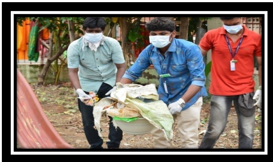
15.08.2017 - Student Volunteers taking part in the cleanliness camp conducted at Kannagi Nagar