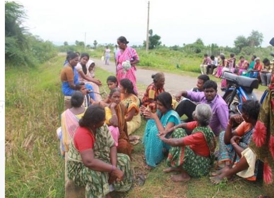
Focussed Group Discussion on MGNREGA