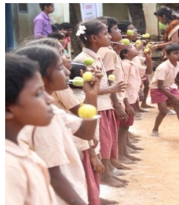
Sports Day in the Primary School