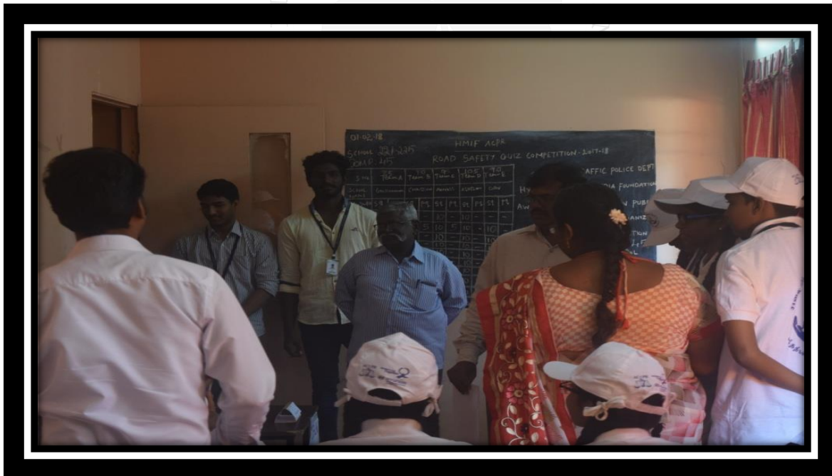
On 30/01/2018, NSS Volunteers conducting Road Safety Competition at Ashram School, Guindy