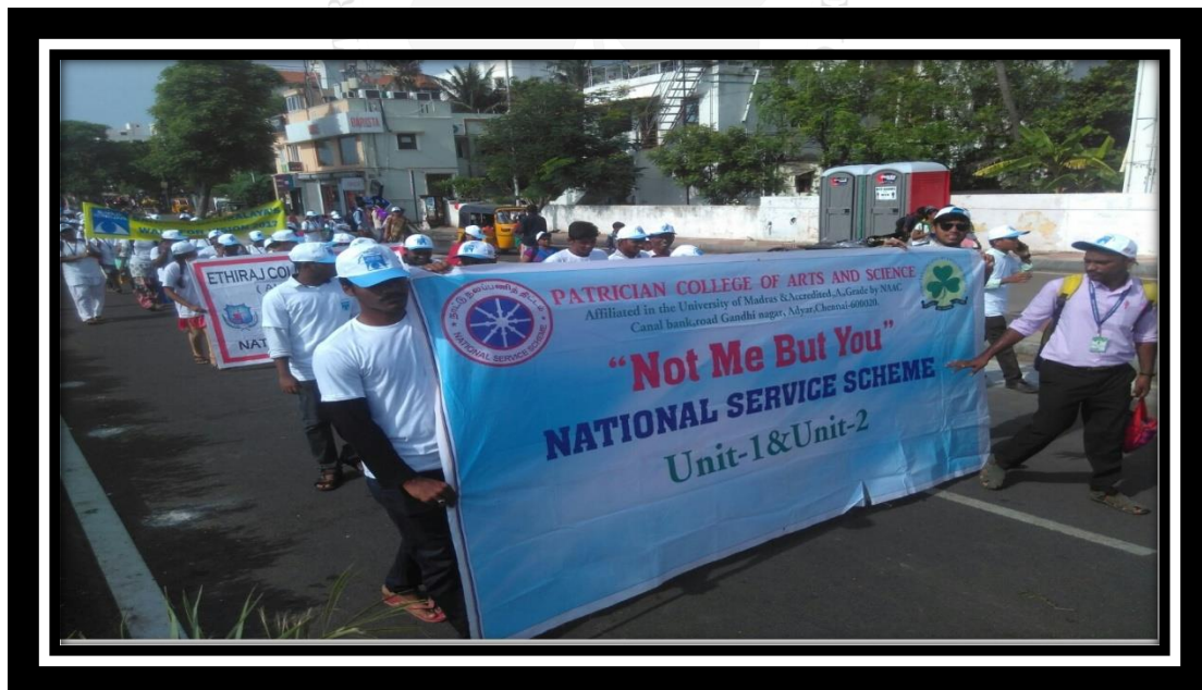
20.01.2018 - Student Volunteers of Patrician College participating in Women Walkathon rally at Besant Nagar