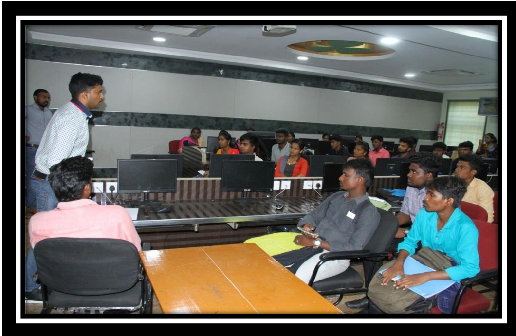
10/03/2018 - Job Aspirants attending the Job Fair 2018, Patrician College, Kotturpuram