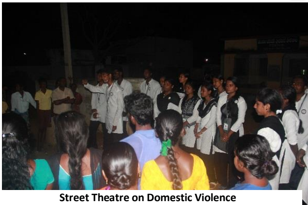
Street Theatre on Domestic Violence