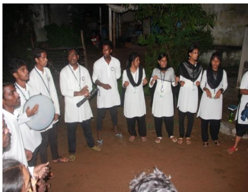
Awareness Song on Communal Harmony

The trainee and the co-trainees had prayer, exercise and went for church service. The trainee with his team left for village visit to Komati kullam and had session on “Unity, Sacrifice, Affection, Handwork, Empathy and Friendship”, the trainee and the co-trainees left for community organization at Sethilmedu and did street play on dengue and Alcoholism. The trainee and the co-trainee had dinner followed by evaluation.