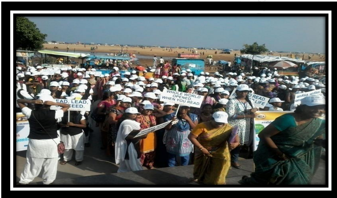
Patrician students participating in the Rally-World Population Day, Elliot's Beach, Chennai on 11 th July 2017