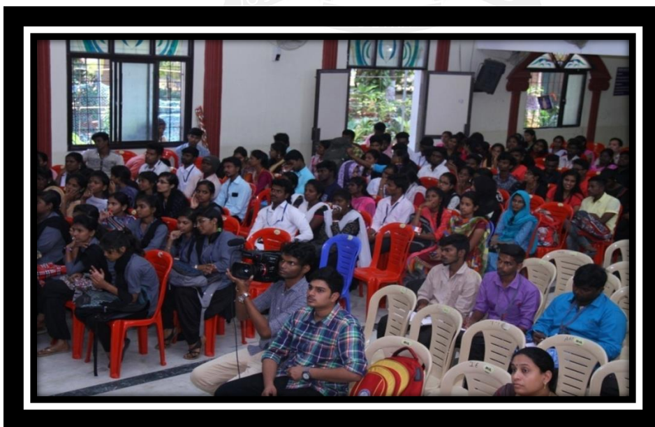
05/02/2018 - Students Participating in Cancer Awareness Competition at Patrician College