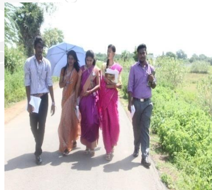
Visit to the Villages