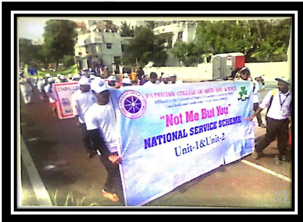
On 8 th September 2017, NSS volunteers participating in the National Eye Donation Day, Chennai