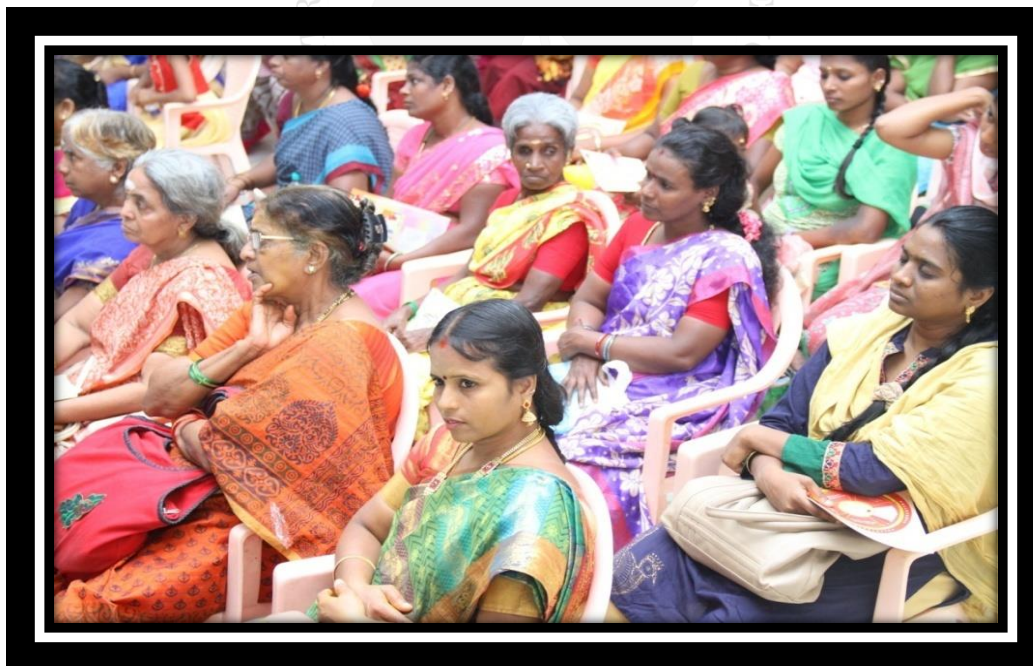
08/03/2018, International women's day celebration at Patrician College.