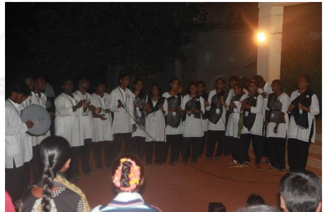
Awareness Song on Communal Harmony