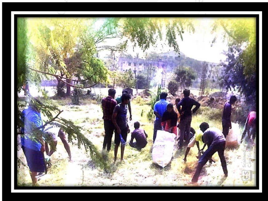
Maruvom Matruvom, Avanipur, Tindivanam on 29 th August 2017