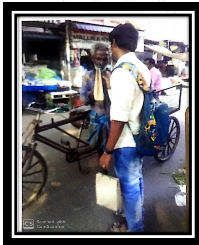
Distributing the food through the Paper bag Mystery Event